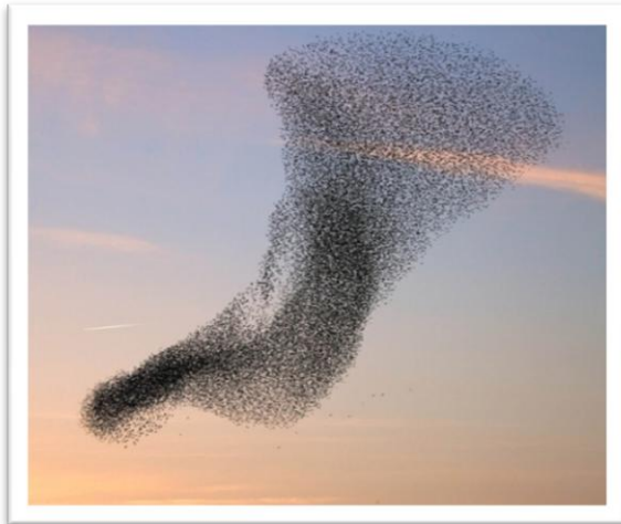
Fig 2. Swarming of Birds

cellular robotic systems. SI systems are typically made up of a population of simple agents interacting locally with one another and with their environment. The agents follow very simple rules, and although there is no centralized control structure dictating how individual agents should behave, local interactions between such agents lead to the emergence of complex global behavior. Natural examples of SI include ant colonies, bird flocking, animal herding, bacterial growth, and fish schooling. The application of swarm principles to robots is called swarm robotics, while 'swarm intelligence' refers to the more general set of algorithms.